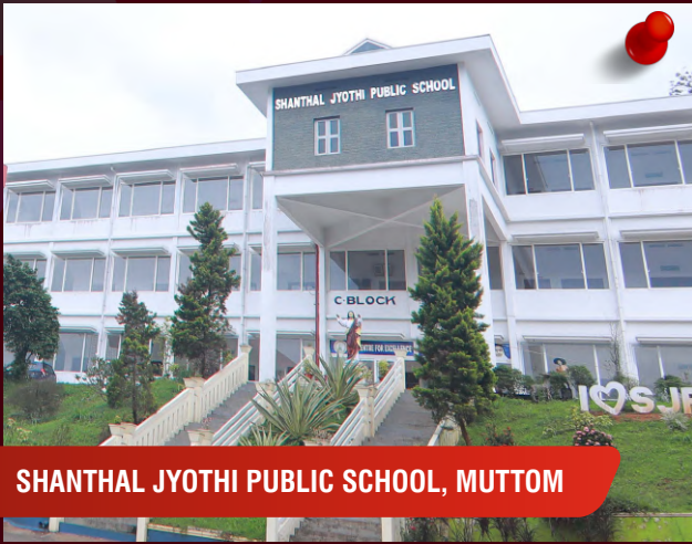
SHANTHAL JYOTHI PUBLIC SCHOOL, MUTTOM

(CATEGORY -1 & ALL THE OFFSTAGE ITEMS OF CATEGORY I - IV (15/10/2022)