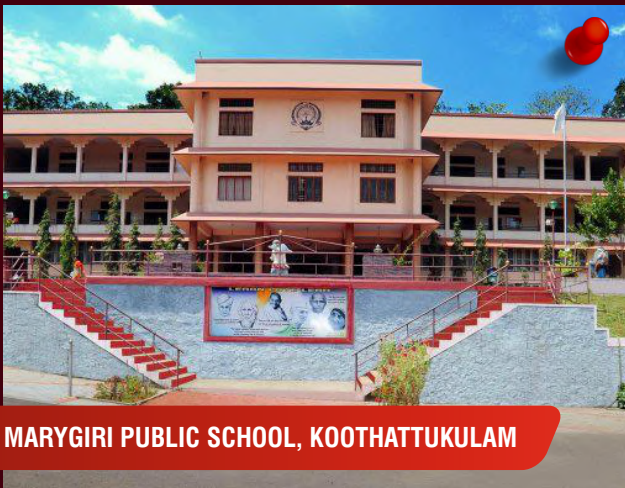
MARYGIRI PUBLIC SCHOOL, KOOTHATTUKULAM

CATEGORY - II, STAGE ITEMS ONLY (19/10/2022)