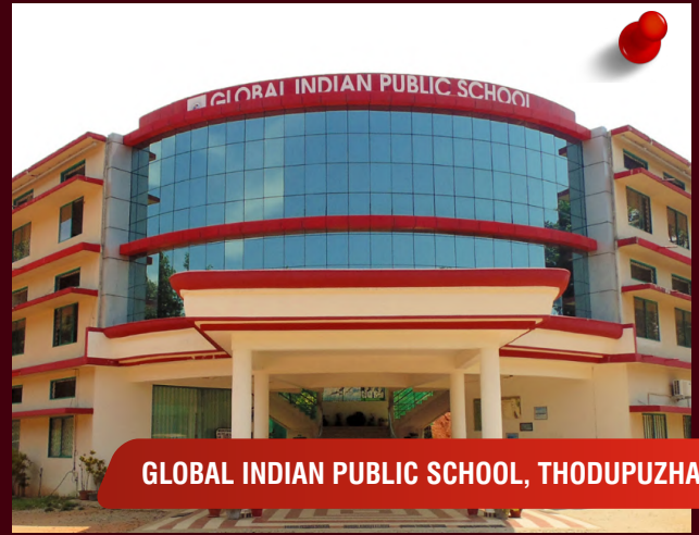
GLOBAL INDIAN PUBLIC SCHOOL, THODUPUZZHA

(CATEGORY -1 & ALL THE OFFSTAGE ITEMS OF CATEGORY I - IV (15/10/2022)